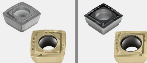
A57 – The strong geometry