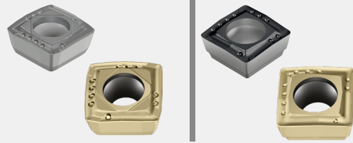
E57 – The universal geometry